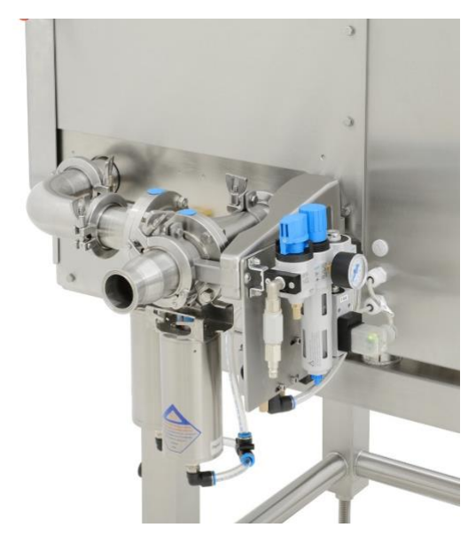
XRAY SHARK® XD08-H1-PIPE with air pressure reject system.