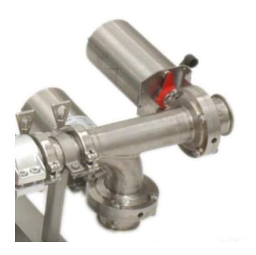
Butterfly-/Shim valve EX-BF

Three different valve types, optimally matched to the respective product, guarantee reliable discharge of metallic contaminants. All valves can be CIP cleaned.