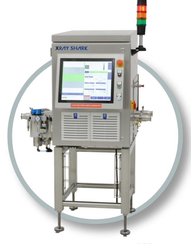
CASSEL XRAY SHARK® XD08-H1-PIPE

X-ray inspection system for packaged products