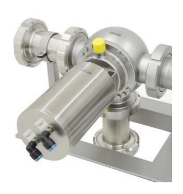
Arc valve EX-BOG