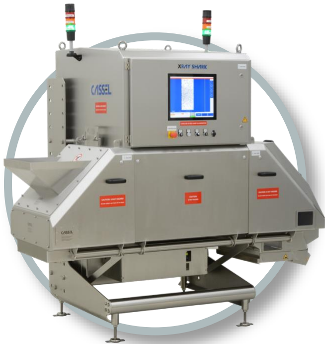
CASSEL XRAY SHARK® XD45-H1-BULK