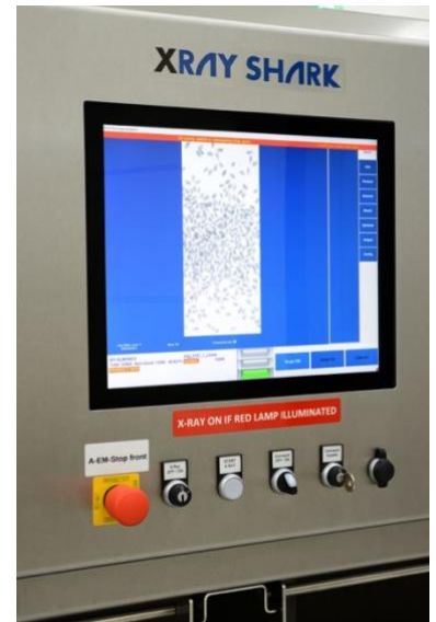
Large display and clearly arranged functions for easy operating.

The CASSEL Inspection XD Bulk X-ray inspection system is suitable for all industries, especially for those with stringent hygienic standards. Thoughtful design allows for simple cleaning & maintenance.