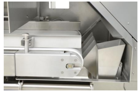
Multilane rejection system